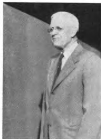
HARVEY FLETCHER who spoke at the dedication of Knudsen Hall at UCLA