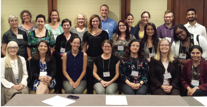
Figure 2. Women in Acoustics Committee Meeting in Honolulu, November 2016

research, and/or service to the field. The WIA luncheon is a highly successful and well-attended event.