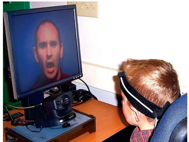
Fig. 1. A participant views a speaker using an eye tracker.

Each subject was placed in a chair 25 inches from a computer monitor. The headband with the magnetic head tracking sensor was placed on each participant's head (see Fig. 1). The participant's pupil coordinates were calibrated with the eye-tracker system by asking the participant to look at col-