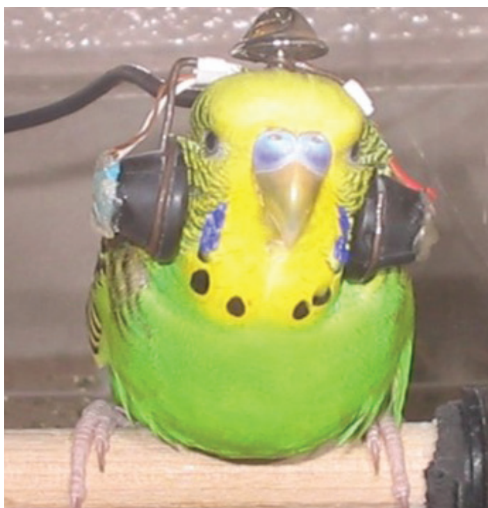
Figure 3. Budgerigar wearing headphones. This bird from the Dent laboratory ran the same task as described in Figure 2 but had stimuli presented through the headphones instead of from the overhead loudspeaker.