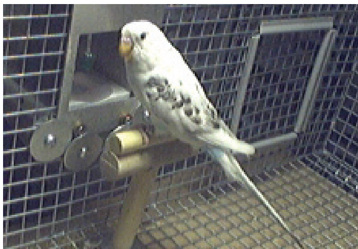
Figure 2. Budgerigar ( Melopsittacus undulatus ) facing two keys in an operant chamber in the Dent laboratory. The bird is required to peck a left key to start a variable waiting interval and to peck the right key when it detects a signal presented from an overhead speaker for a millet reinforcer.