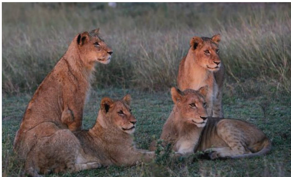
Figure 1. Lions ( Panthera leo ).

Acoustic communication is vital for any living being. An antelope unable to hear a lion pride sneaking up on it ( Figure 1 ) will be dinner for those lions, especially at night when visual cues are minimal. On the other side of the coin, predators unable to hear the rustling of prey will go hungry for a long time, likely leading to starvation. Across the animal kingdom, acoustic communication is also used for mate attraction, courtship rituals, offspring detection and recognition, territoriality, conflict resolution, coordinating hunts, and alarm signaling. Although some animals will use multiple sensory modalities across these communication contexts, acoustic communication has the benefit of traveling long distances, not requiring a direct line for communication, and working day, night, or in dense environments. Acoustic signals can also be cryptic, such as narrowband high-frequency predator detection signals, which can be sent to warn conspecifics about danger without giving away the sender's location (Bradbury and Vehrencamp, 2011).