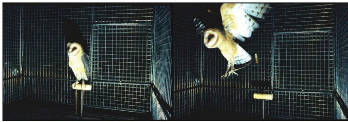
Figure 4. Barn owl ( Tyto alba ) in an operant setup in the laboratory of Dr. Georg Klump at the Technical University of Munich. The owl sitting on the rear perch is breaking an infrared beam (left). When it discriminates a change in the repeating background sound, it is required to fly to the front perch (right), breaking another infrared beam for a food reinforcement.

Psychoacoustics studies have revealed interesting trends in animal hearing, with some studies showing a remarkably conserved evolution of auditory processing across vertebrates and others showing unique adaptations for animals to thrive in specific environments. Samples of some interesting findings obtained using animal psychoacoustics are presented in the sections below. The studies presented span the various psychoacoustic techniques used by researchers interested in knowing more about the auditory world of animals. These are not meant to be exhaustive; they are simply interesting to the author and hopefully to the reader. Where possible, the original or most complete measures have been presented instead of the most recent findings in order to highlight the pioneering investigators of this field.