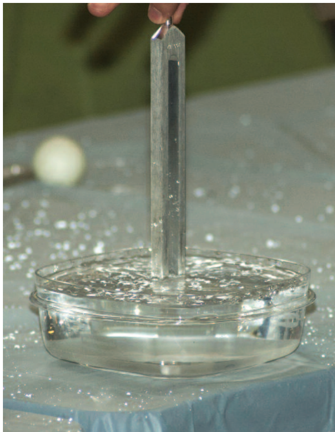
Fig. 4. Tuning fork vibration demo at the 2013 KITES fair.

The GT-ASA outreach program is continuing to expand to reach a wider audience. Currently, the outreach program is developing an open and easy-to-use set of acoustics demonstration modules targeted for use by educators, especially those without expertise in acoustics. The GT chapter welcomes any new suggestions and is eager to