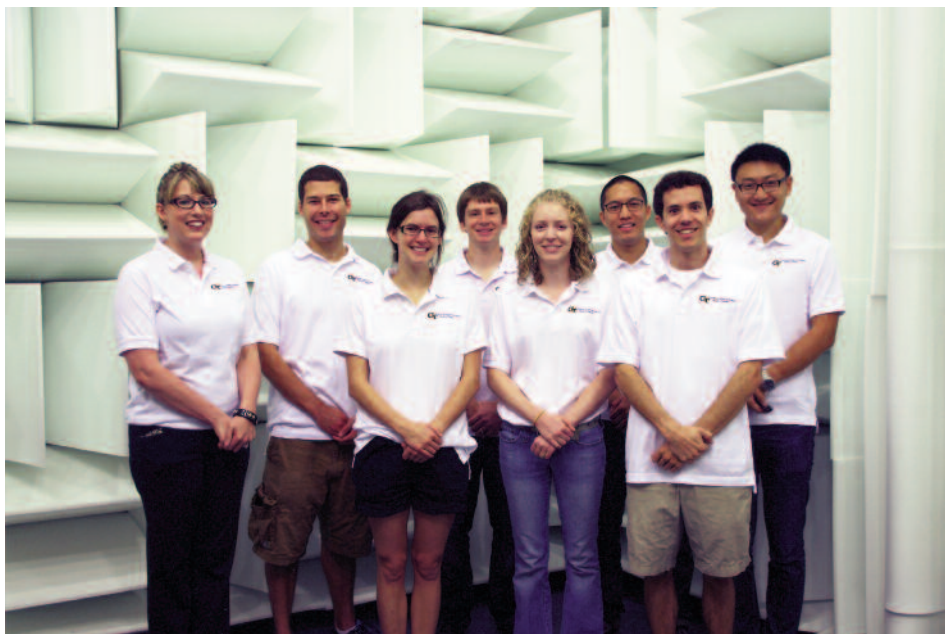
Fig. 1. The ASA Georgia Tech chapter in the hemi-anechoic test chamber.

In 2007, looking to cultivate student interest in acoustics, graduate students and faculty at the Woodruff