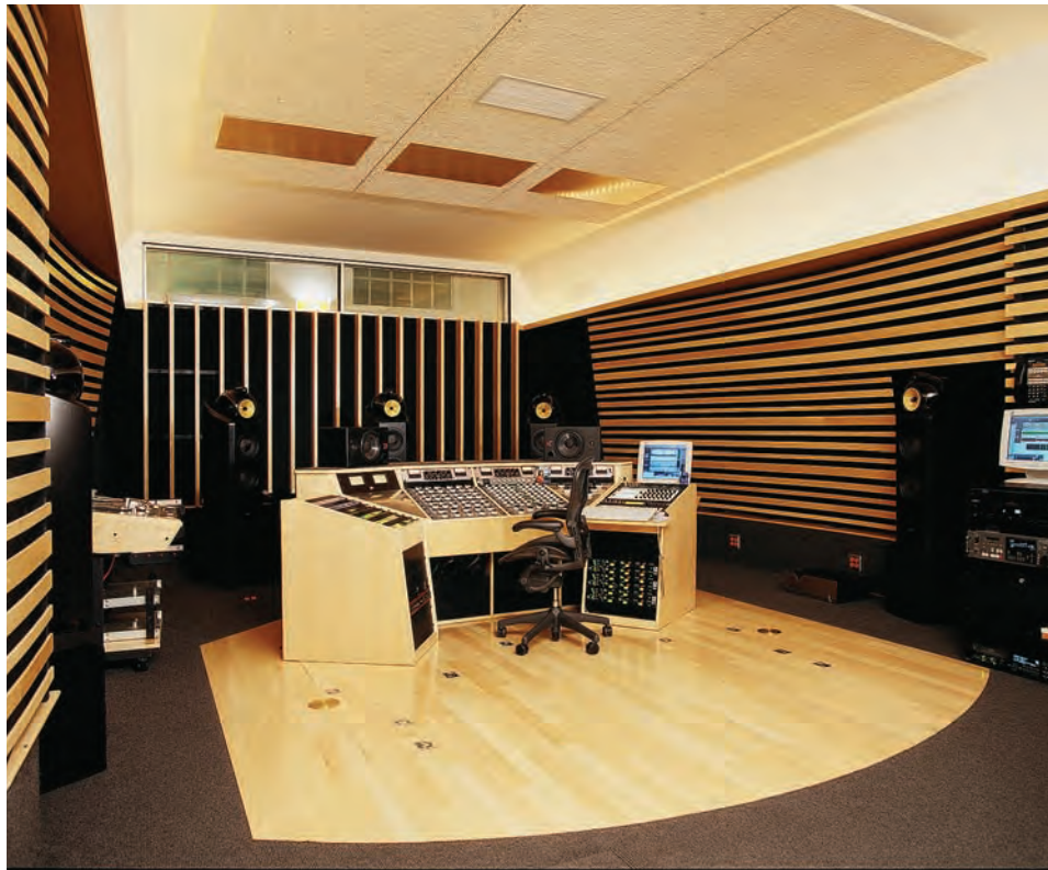
Fig. 2. Marcussen Mastering, Hollywood, California.

spatial relationships between the loudspeakers, the sloping ceiling, the console, and the outboard equipment cabinet. The studio window affords full visibility between the loudspeakers, but the glass dips down and extends under the loudspeakers as well. The rear ceiling and the undersides of the soffits are fully trapped.