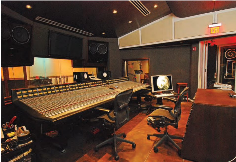
Fig. 1. Interscope Records control room, showing flush-mounted loudspeakers, sloping ceiling, and side soffits.

hears both speakers (interaural crosstalk), a phantom center image is not the same as that heard on headphones. The direct path length from either loudspeaker to one ear is different from that to the other, producing a comb filter with its first dip around 2 kHz. In contrast, a good ensemble of symmetrical lateral reflections spreads out the sweet spot, adds depth to the stereo image, and helps fill in the 2 kHz dip.