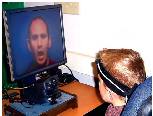
Fig. 1. A participant views a speaker using an eye tracker.

Each subject was placed in a chair 25 inches from a computer monitor. The headband with the magnetic head tracking sensor was placed on each participant's head (see Fig. 1). The participant's pupil coordinates were calibrated with the eye-tracker system by asking the participant to look at col-